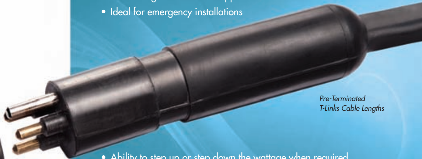
Pre-Terminated T-Links Cable Lengths